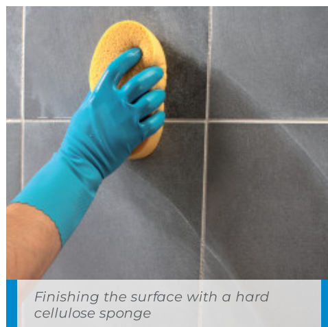
Finishing the surface with a hard cellulose sponge