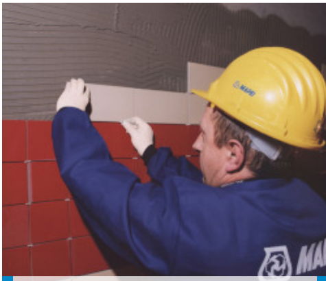
Fixing ceramic tiles on walls working from the top to the bottom