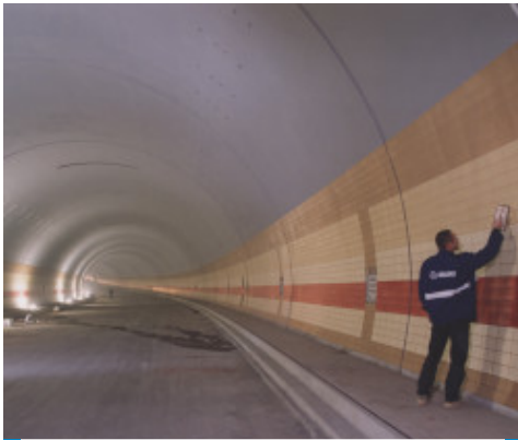
Mrázovka Tunnel - Prague - Czech Republic

N.B. The technical data of Kerabond T mixed with Isolastic are on the latter's technical data sheet.