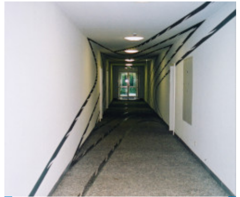
Alliance insurance offices - Munich - Germany