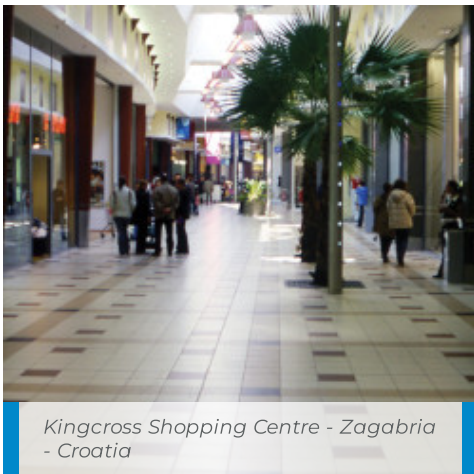
Kingcross Shopping Centre - Zagabria - Croatia