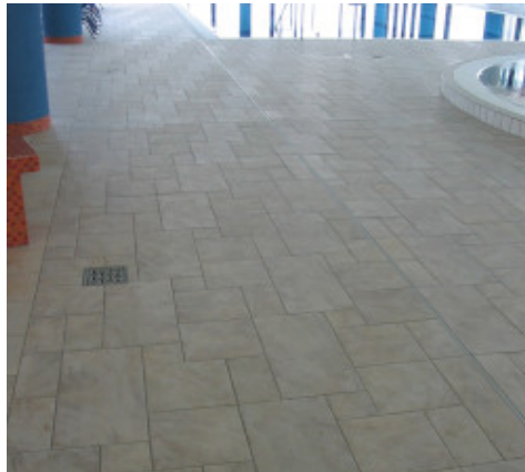
Hotel Radison - Bükkfüdő - Hungary