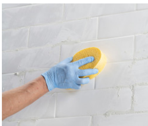
Cleaning and finishing grouts with hard cellulose sponge