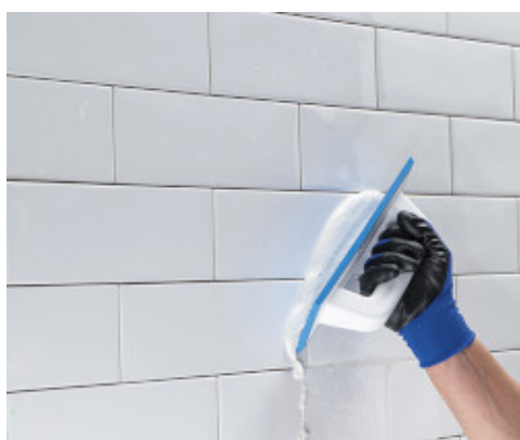
Application of Keracolor SF with MAPEI trowel