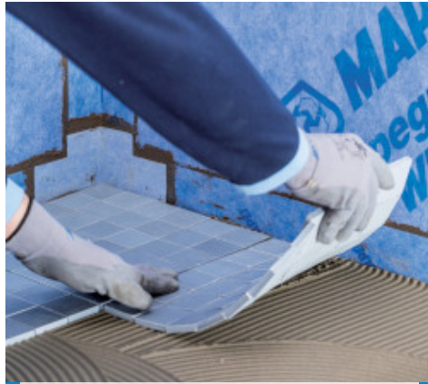
Laying of the tiles