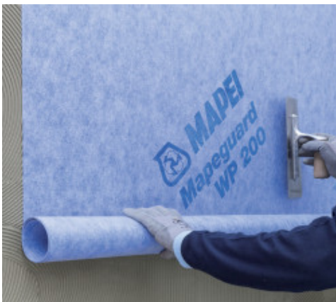
Laying Mapeguard WP 200