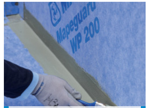
Application of the Mapeguard WP Adhesive in order to seal the joints in the corner before the application of Mapeguard ST