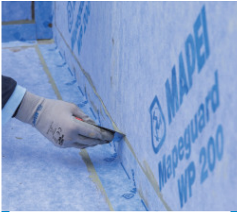
Application of Mapeguard ST