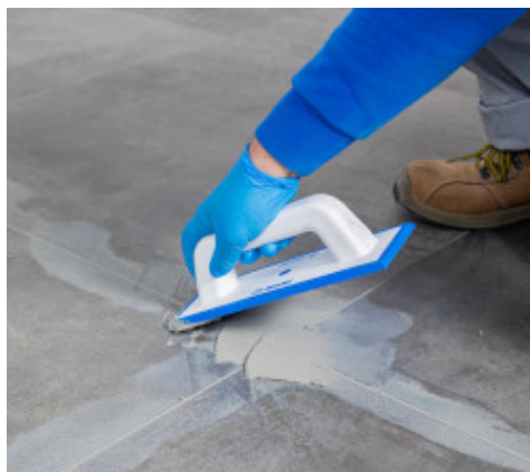
Grout the surface of the room