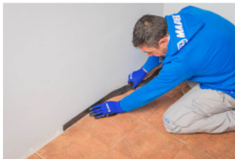
Apply Mapesonic Strip adhesive tape around the perimeter of the room

To use the aforementioned MAPEI products correctly, please refer to the specific technical data sheet for each product available at our website www.mapei.com .