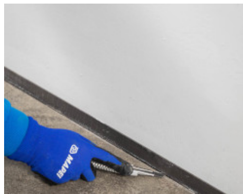
Once the grout has hardened, trim the perimeter of the Mapesonic Strip to remove the excess