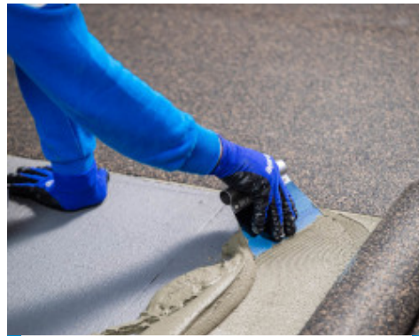
After suitable preparation of the substrate, spread on the adhesive to bond the soundproofing sheets