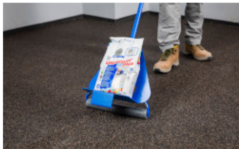
Massage the surface with a rigid roller or flat trowel, starting from the centre and working towards the edge