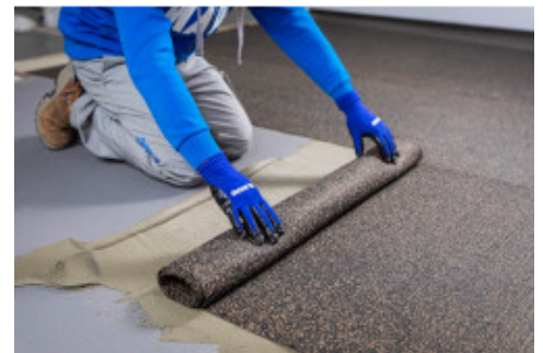
Unroll the sheets of Mapesonic CR on the surfaces to be soundproofed