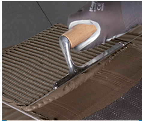
Spreading the adhesive on the back of the tile