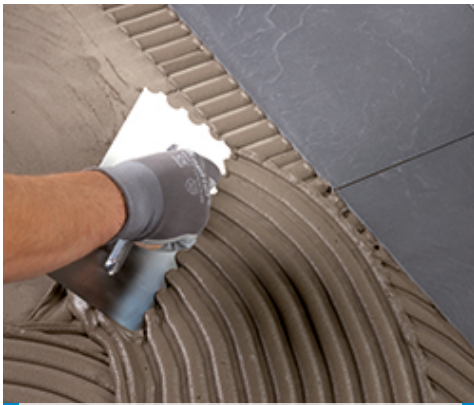
Spreading the adhesive on floor with a 9 mm round-tooth notched trowel