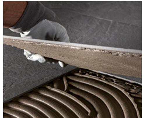
Installing thin porcelain tile on floor